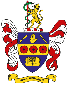
College of Surgeons of Malaysia