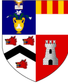
University of Aberdeen